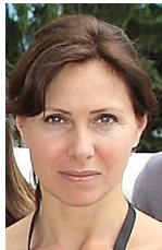
Isabelle OBADIA Europa Distribution - FR Isabelle.obadia@europa- distribution.org