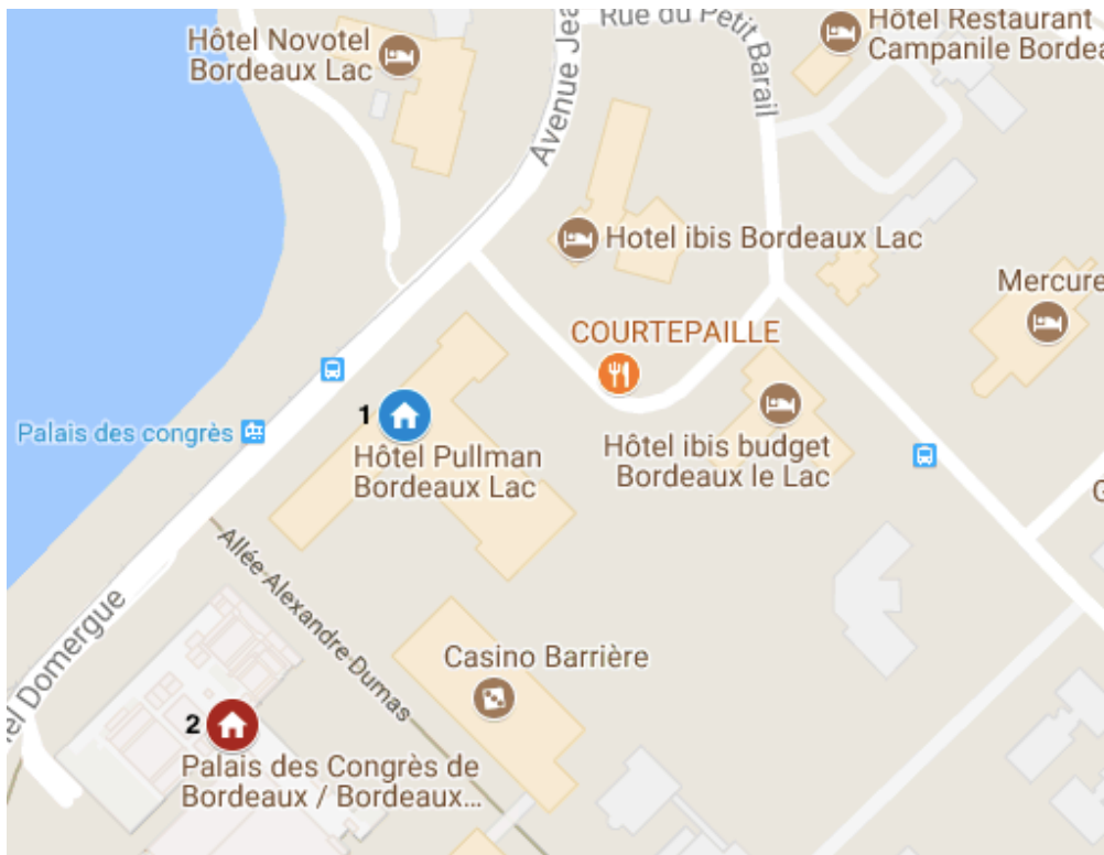
Detail 1: Pullman Hotel, Palais des Congrès