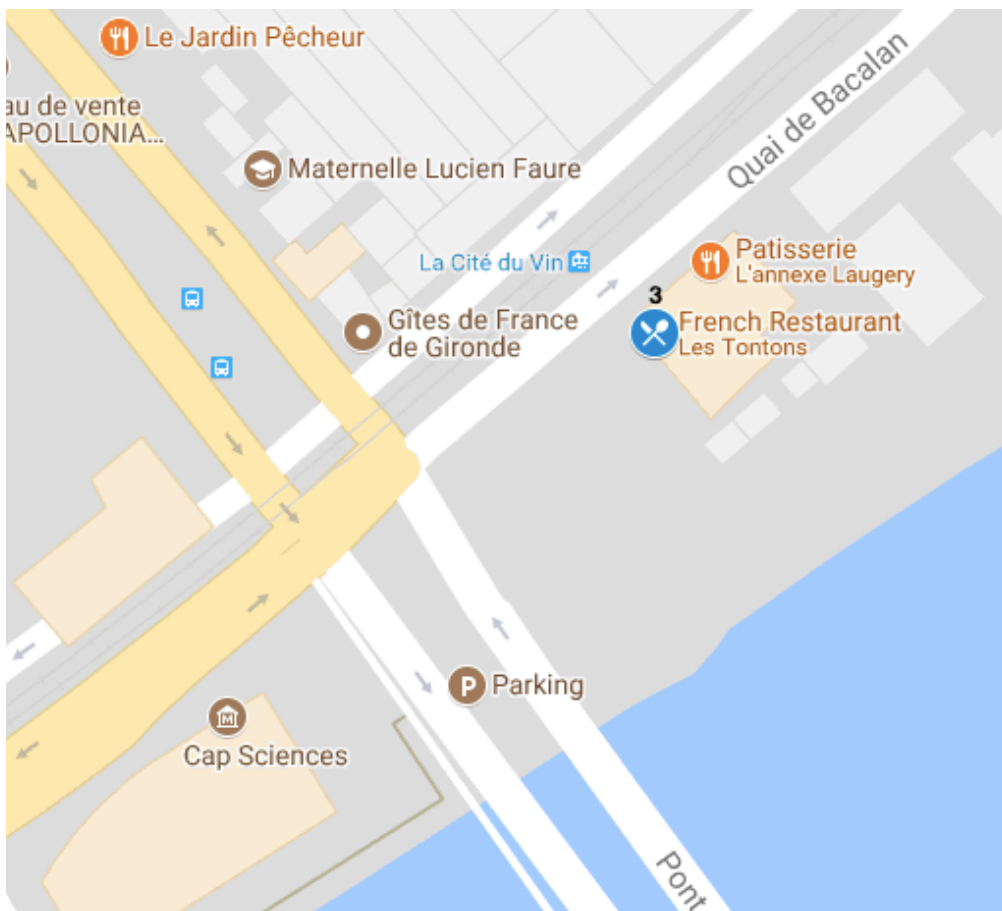
Detail 2: Restaurant Les Tontons